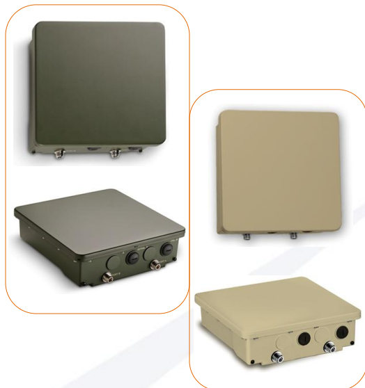
Available in Military Green and Desert Sand colors

Audible tone and real-time signal strength measurement allows quick installation. Pelletier heating and cooling technology inside a ruggedized enclosure enable deployment in extreme weather conditions