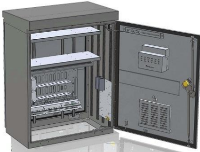
Size 6 - Dual Door (Front View)