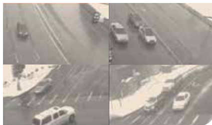
Quad view of four cameras for intersection overview